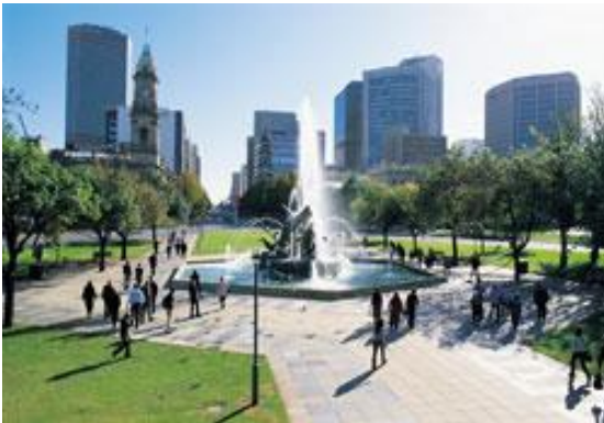
Adelaide City Centre