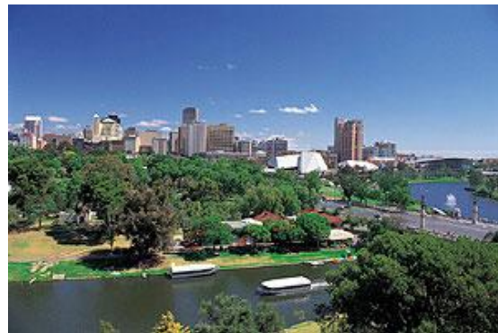
Adelaide City Views