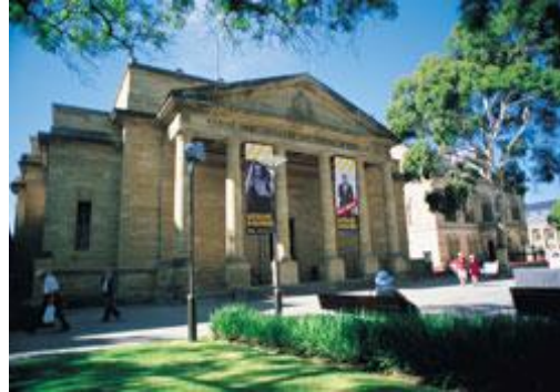
Art Gallery of South Australia, Adelaide