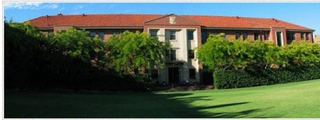
Memorial Building, St Mark's College, University of South Australia

A range of accommodation options will be available including accommodation at the University of South Australia in the heart of Adelaide and prices from A$50 per night. These venues are shown below: