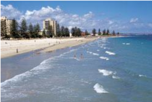
Adelaide Beach at Glenelg

Adelaide is the capital of the State of South Australia with a population of more than 1 million. It has a number of attractions including the Art Gallery of South Australia, the Adelaide Casino, the Botanic Gardens with sixteen hectares of native Australian plants and great Australian beaches. The National Aboriginal Cultural Institute is devoted to Aboriginal culture. All destinations are within walking distance, the beaches are accessible by tram. The vineyards of the Barossa Valley are a short day trip away.